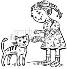
Feed the Street cats