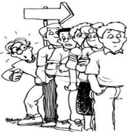
Wait in a line